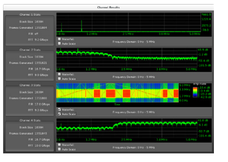
AXIS RuntimeView screen shot – multi-threaded application on dual Intel Core-7 processor.

The AXISPro-01M development environment supports application optimization on multi-core, multi-threaded and multi-node distributed system architectures across multiple operating systems including Linux, Windows and VxWorks and includes quick start signal and image processing examples to accelerate time-to-solution.