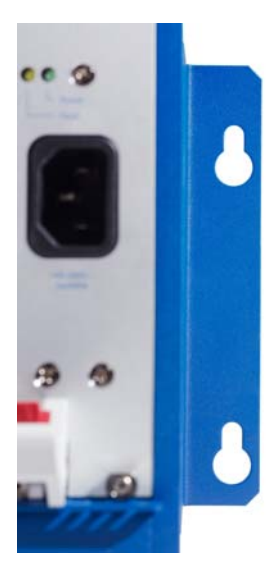
Wall Mount Option