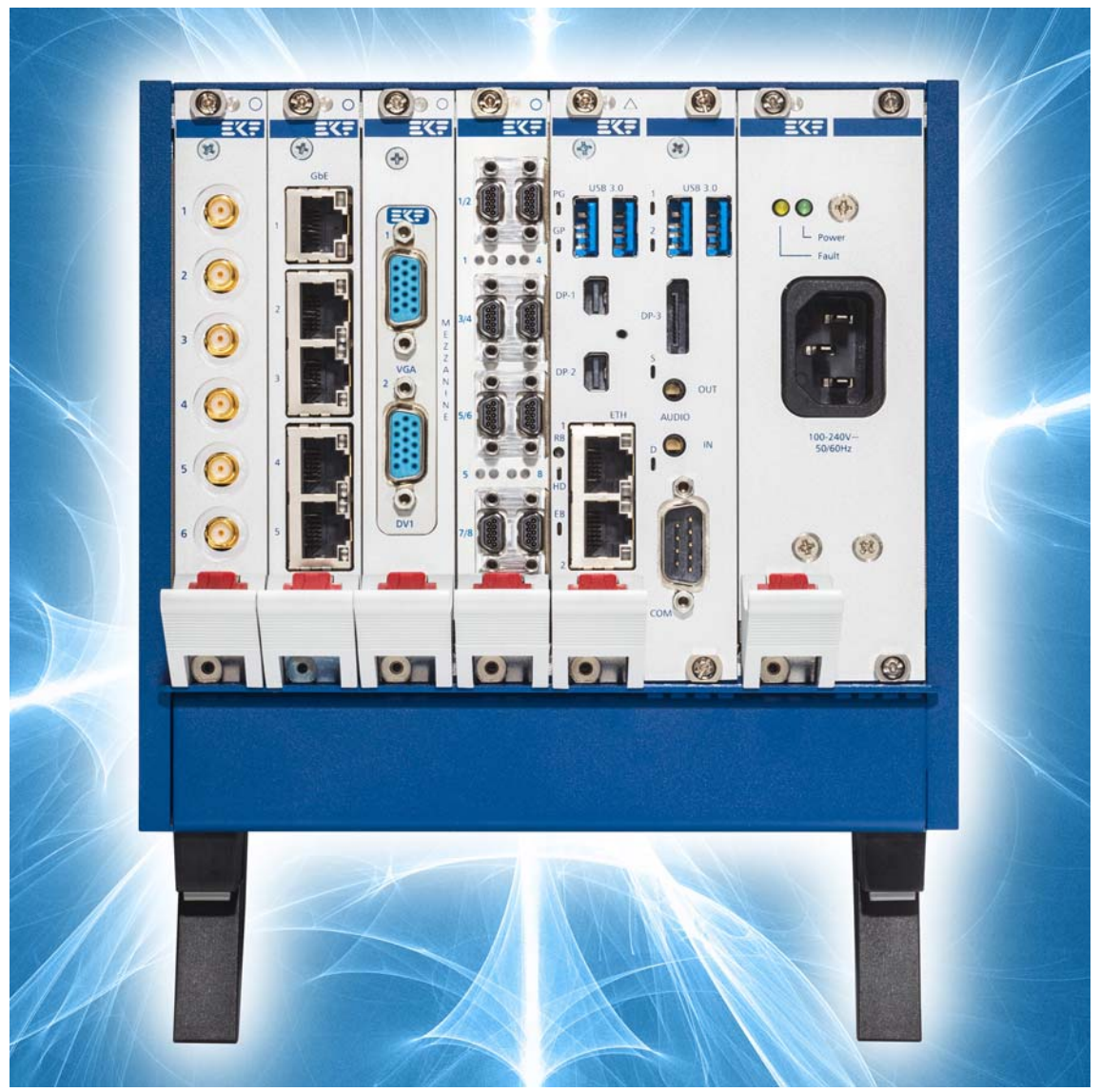
Typical System Configuration