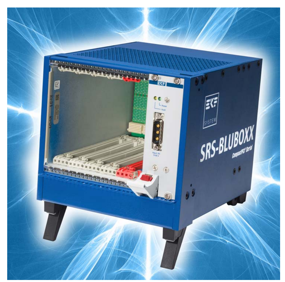
SRS-BLUBOXX w. DC Power Supply